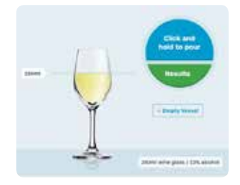
Find out more at: alcohol.org.nz/alcohol-you/ whats-standard-drink

Can you pour a standard drink? and How much alcohol is that? are interactive games on alcohol.org.nz. They are a great way to learn about standard drinks and the amount of alcohol there is in a range of alcoholic drinks.